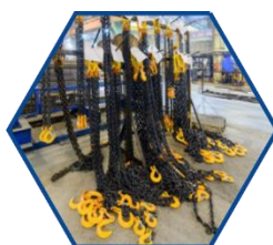
TESTING & CALIBRATION